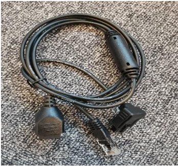
3 pcs Cascade cable between the control boxes.