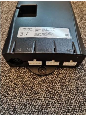
3 pcs control box